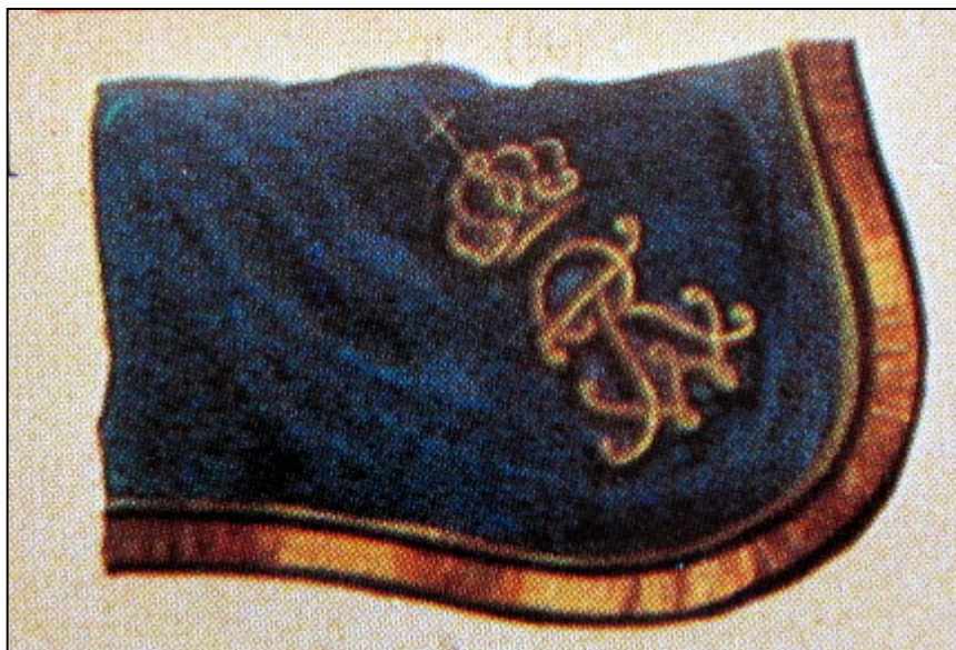
Monogram for officers' shabraque

Buttons - gold or silver depending on regimental button colour (brass/white metal). Horse furniture - dark blue shabraque edged in gold or silver, depending on the regiment's button colour, with monogram in corner. Reins and pistol holsters were mid-brown with brass accoutrements.